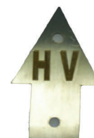
Q51-HV 85mm x 50mm HV Arrow