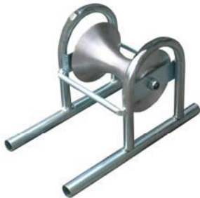
RTRA-140 Raised trench roller guide with 140mm aluminium roller

Similar to the one above and has a plastic roller. Its rating is also 125kg but that's a WLL. The roller will take cables up to a diameter of 150mm. The roller is placed behind the direction of pull and is offset from centre to reduce the possibility of the roller tipping forward during pulling operations