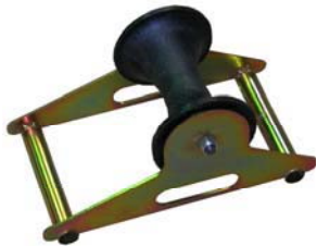
NTR-120 Flat trench roller guide with 140mm plastic roller

A durable trench roller guide that can also be turned on its side for corner pulls. It has a 125kg SWL aluminium roller which comes standard with sealed bearing. The roller is placed behind the direction of pull and is offset from centre to reduce the possibility of the roller tipping forward during pulling operations.