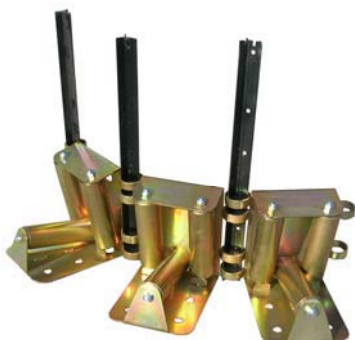
TRC60-230 1 Tonne Trench Corner Roller Guide

This trench roller guide is the same as the RTRA above but with a plastic roller. The unique feature of the RTR is if you are laying two cables one on top of the other this style will allow you to run the bottom cable first and by removing the roller guide and placing it over the top of the existing cable you are able to pull the other cable into position.