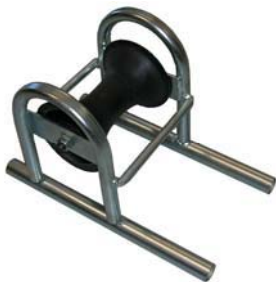
RTR-140 Raised trench roller guide with 140mm plastic roller

This trench roller guide will accommodate cables up to a diameter of 150mm and the roller is rated at 125Kg SWL. Like its predecessors the roller is placed behind the direction of pull and is offset from centre to reduce the possibility of the roller tipping forward during pulling operations. The frame may be altered for use on its side when pulling the cable around corners