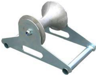
NTRA-120 Flat trench roller guide with 140mm aluminium roller

A durable trench roller guide that can also be turned on its side for corner pulls. It has a 125kg SWL aluminium roller which comes standard with sealed bearing. The roller is placed behind the direction of pull and is offset from centre to reduce the possibility of the roller tipping forward during pulling operations.